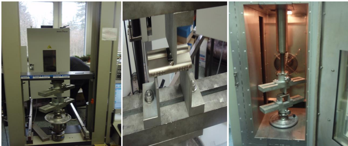
Figure 1 Testing of cylindrical locks outside and inside the thermal chamber

near the tooth about 14 mm of non-homogenous and non-compact material). The difference lies in choosing higher speed of stress to which the tested samples are subjected (Fig. 1). The experiment was carried out using a device made by Zwick. Product Zwick 1456 is designed for compression, tensile and bending tests of materials which can be conducted at different temperatures (within the range from -80 °C to +250 °C). The device is equipped with the testXpert II software providing the necessary setting options and input data, the calculating part of the measurement followed by visualization of the obtained data. One of the essential parts of Zwick 1456 enabling measurements within the temperature ranges above is a thermal chamber. It is a thermally insulated space which can be positioned so that it surrounds the measured sample. Break resistance was tested by determining bending strength. The cylindrical lock is during the bending strength test placed on two points 50 mm from each other. The third point is situated between them in the centre in the opposite direction to the support. This third acting point applies force to the weakest part of the cylindrical lock body between the both cylinders of the lock.